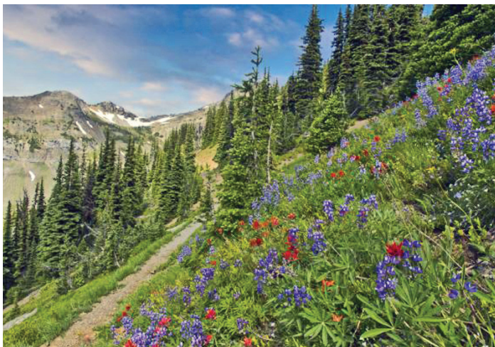
Austin-Tonopah Ranger District, Humboldt-Toiyabe National Forest.