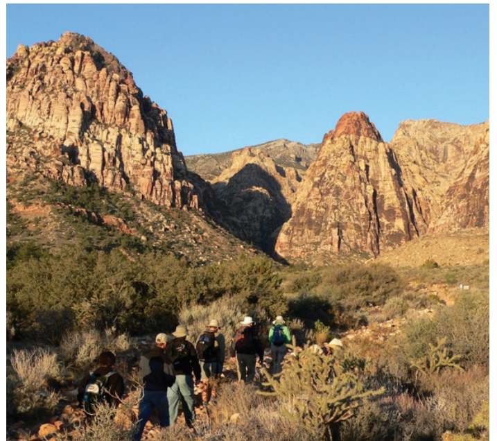
On the trail into Pine Creek Canyon.

to a maze of hiking, running and mountain biking trails, and the dramatic rock formations from which it takes its name make it one of the world's premier rock-climbing destinations, with several thousand climbing routes snaking up its giant slabs and gullies. 65 The area provides crucial habitat for more than 100 species of birds, 45 species of mammals and a rich diversity of other wildlife, including the desert tortoise, listed by the U.S. Fish and Wildlife Service as a Threatened species. 66 Recent years have seen a surge in visitor numbers, with a record-breaking 3 million people visiting the area in 2018. 67 Since the first 10,000-acre parcel of land was set aside by the BLM in 1964, Red Rock Canyon has benefited from at least $3 million in LWCF Federal Side funding, including funds for land purchases to enable this exceptional landscape to be preserved for generations to come. 68