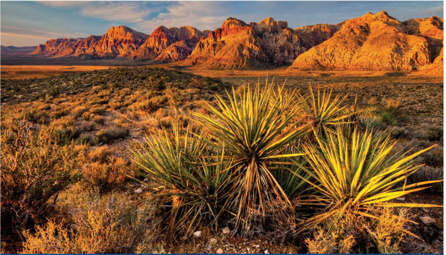
Red Rock Canyon National Conservation Area.

to a maze of hiking, running and mountain biking trails, and the dramatic rock formations from which it takes its name make it one of the world's premier rock-climbing destinations, with several thousand climbing routes snaking up its giant slabs and gullies. 65 The area provides crucial habitat for more than 100 species of birds, 45 species of mammals and a rich diversity of other wildlife, including the desert tortoise, listed by the U.S. Fish and Wildlife Service as a Threatened species. 66 Recent years have seen a surge in visitor numbers, with a record-breaking 3 million people visiting the area in 2018. 67 Since the first 10,000-acre parcel of land was set aside by the BLM in 1964, Red Rock Canyon has benefited from at least $3 million in LWCF Federal Side funding, including funds for land purchases to enable this exceptional landscape to be preserved for generations to come. 68