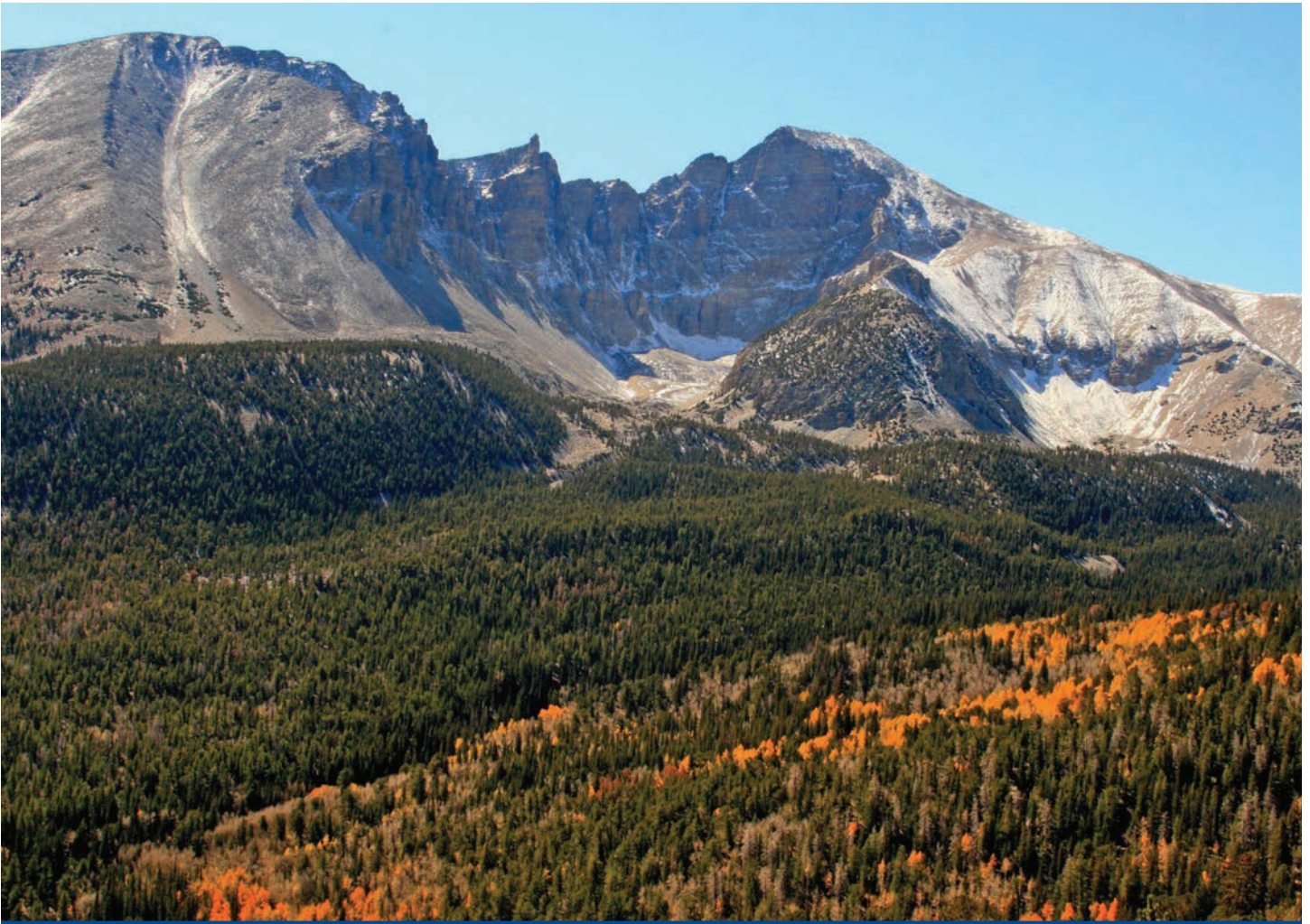
Wheeler Peak – the highest mountain in the Snake Range – towers over the forests of Great Basin National Park.

boating, fishing and watersports on Lake Mead and Lake Mohave, canoeing and rafting on the crystal-clear waters of Black Canyon, and hiking on the miles of trails that crisscross the desert wilderness. 62 LWCF funding has helped make this possible, with grants from the State Side and Federal Side programs totaling more than $5.2 million.