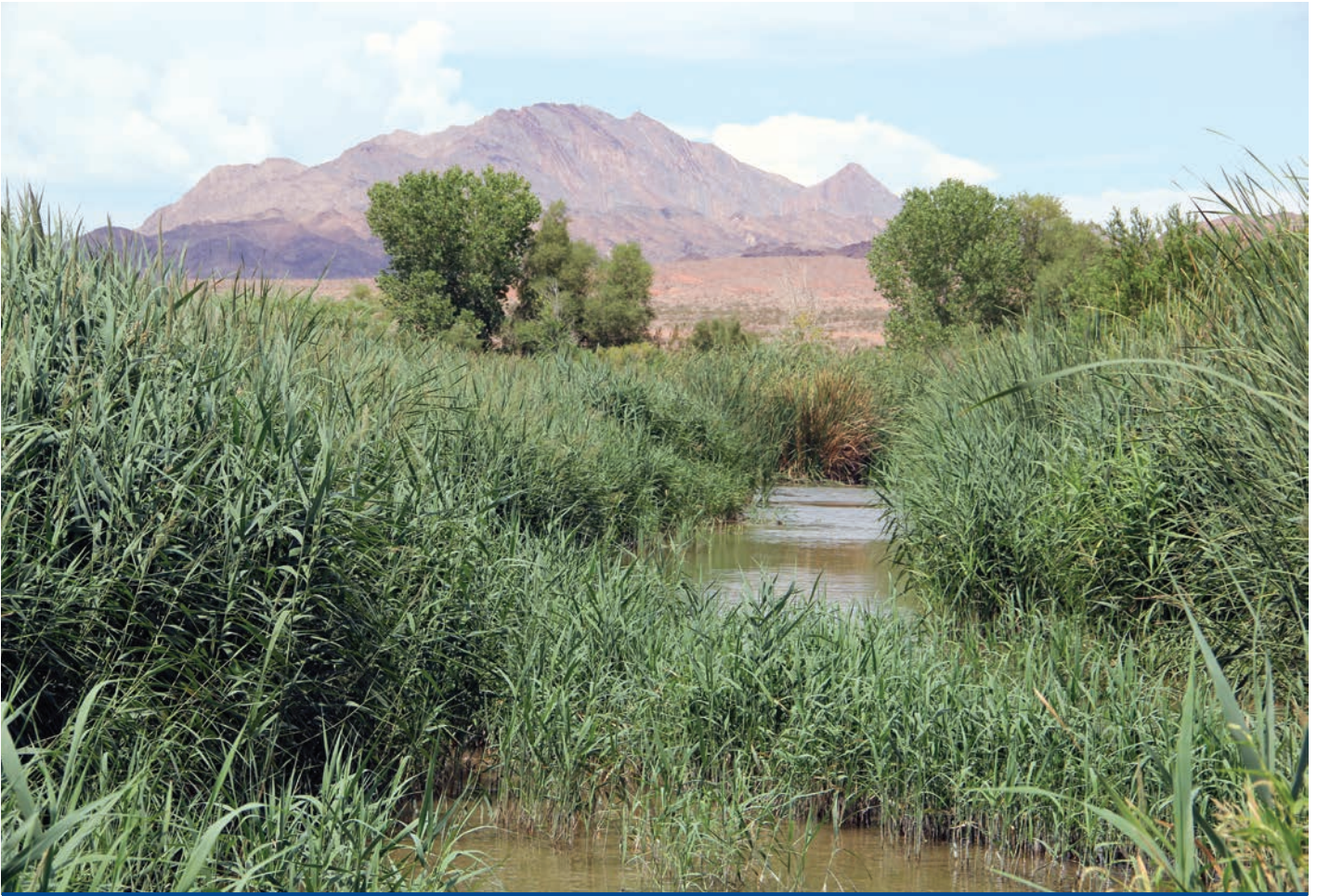
The view from the loop trail at Clark County Wetlands Park.