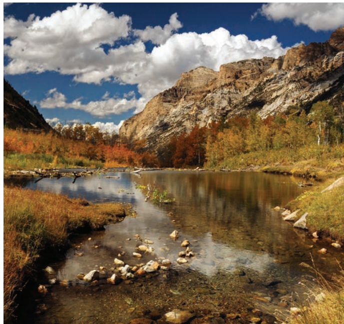
Reflections on a beaver pond in Humboldt-Toiyabe National Forest.