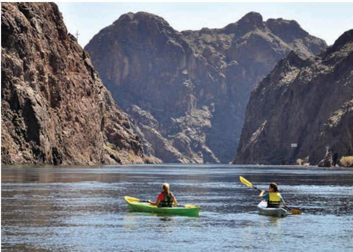
Kayaking through Black Canyon, Lake Mead National Recreation Area.