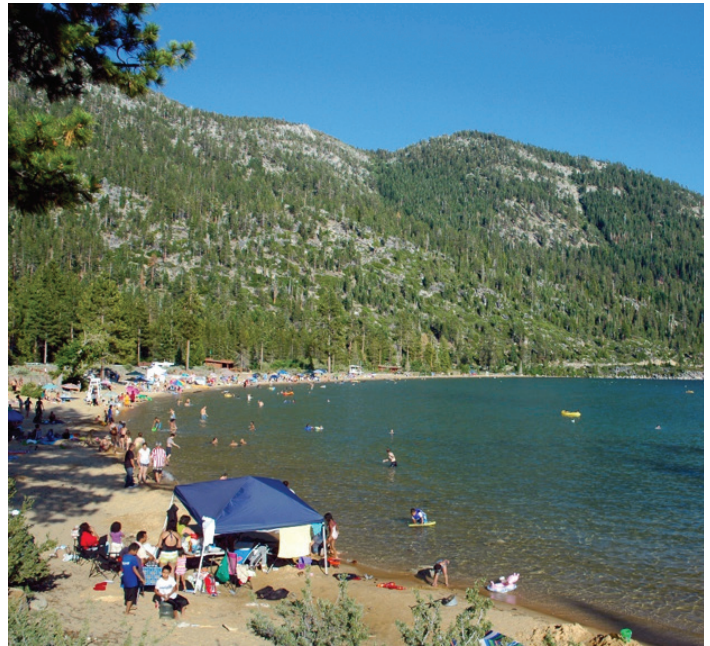
Swimmers and picnickers enjoy the beach at Sand Harbor, Lake Tahoe-Nevada State Park.

In addition to more than $100,000 in statewide State Side grants for development and maintenance of facilities across its State Parks system, Nevada has also received a total of more than $1 million to fund a range of statewide planning projects that have led to enhanced opportunities for outdoor recreation and contributed to wildlife conservation initiatives. 94