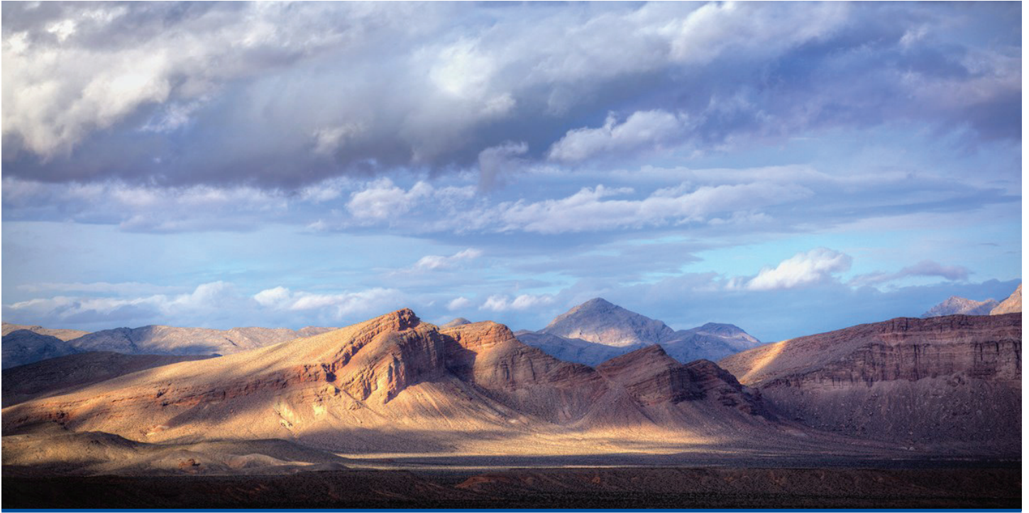
Lake Mead National Recreation Area.