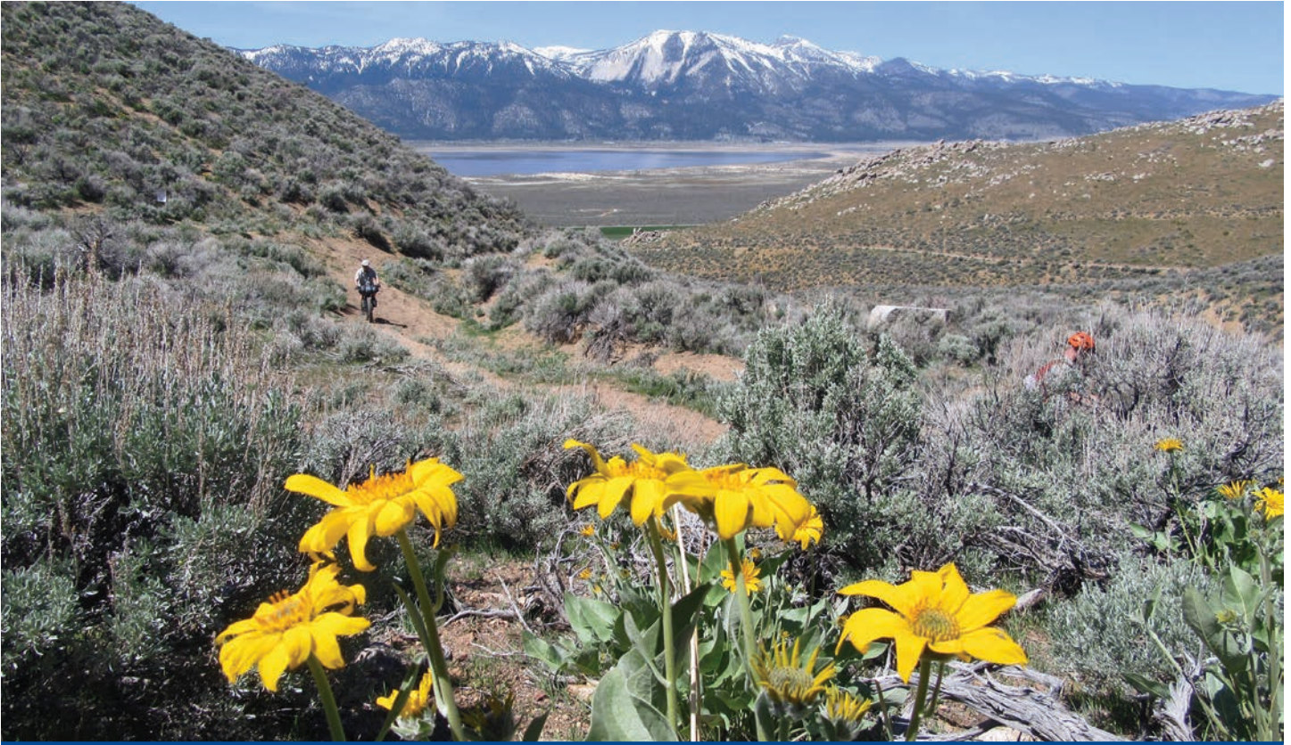
Bikepacking in Washoe Lake State Park.