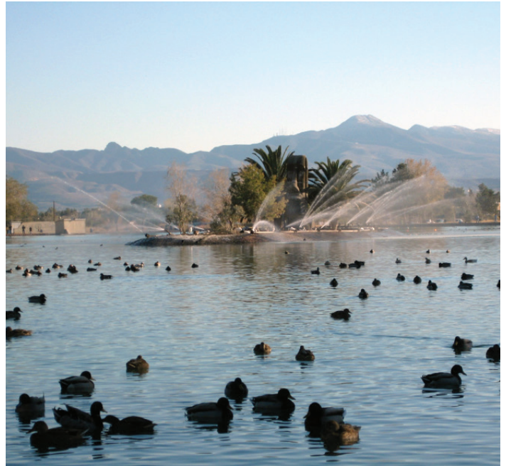
Sunset Park includes a lake for fishing.